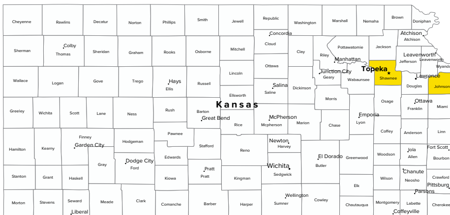
*Last Revised 5/9/2018