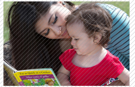
1994 Denver, CO 735 Large proportion of Hispanics Nurses and paraprofessionals